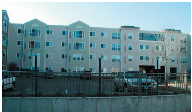
At the center of the block, an open area provides surface parking, some vegetation and an entrance to parking below the building.