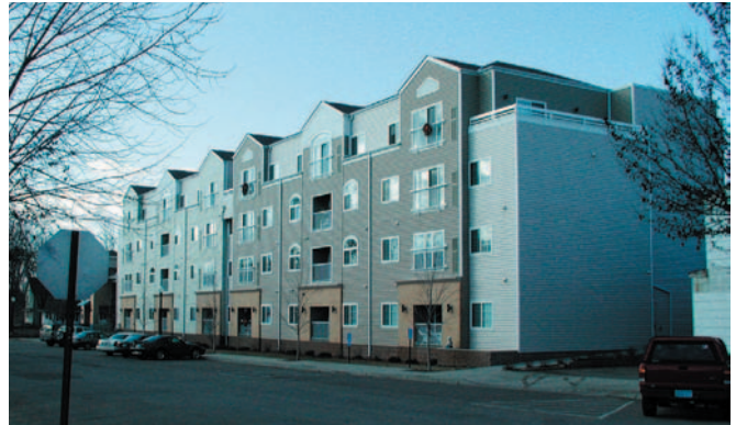
Large building faces are broken down into smaller volumes in several ways: shallow insets, frequent vertical elements, and material and color changes.