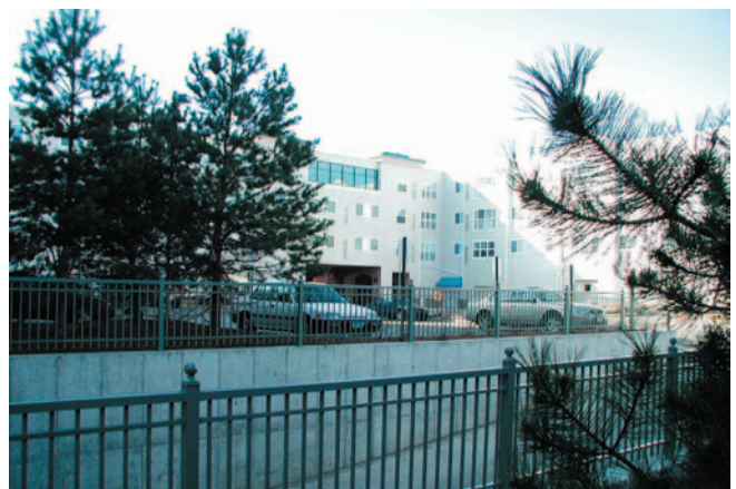
The entry to below-grade parking is in one corner of the central courtyard and partially screened by vegetation.