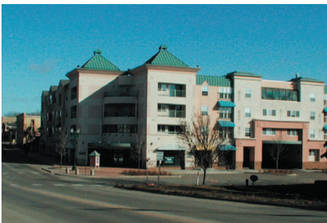
A slight hill helps minimize the impact of River Gables' 4 stories on adjacent properties. The entry to the parking court is visible on the right.