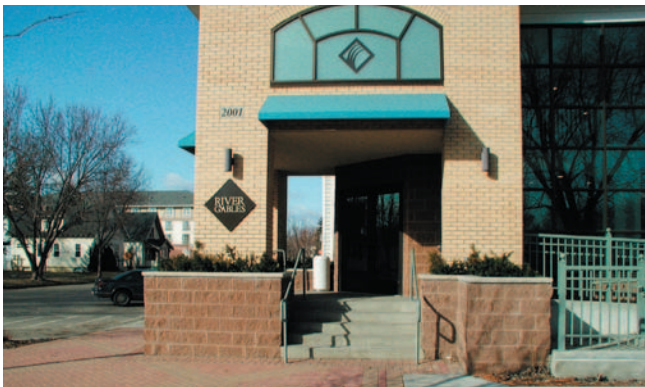
Masonry materials, well-designed details and vegetation create a welcoming image at each of the entries.