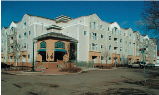
A lower entry on the southeast corner breaks up two larger apartment wings on either side.