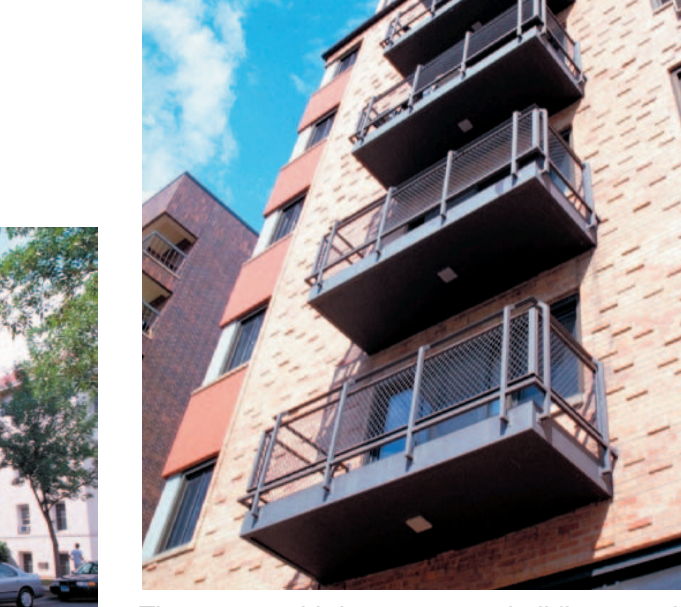
The newer, mid-rise apartment buildings provide open space in the form of balconies, rooftop decks, and small, enclosed lawns that are elevated from the street. The older apartment buildings have small, shared yards. The entire Uptown area has easy access to recreational space, commercial areas, entertainment, and transit.