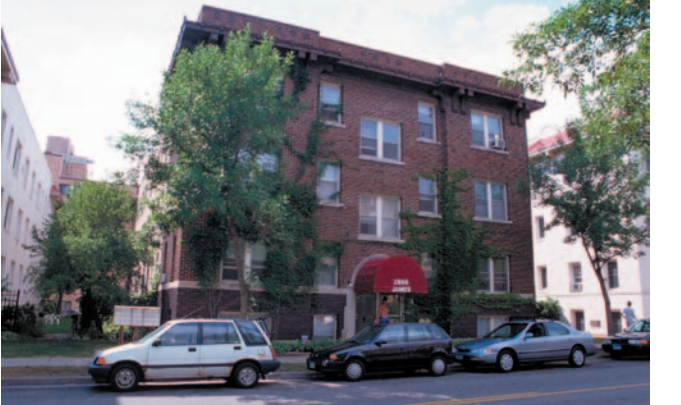
Most of the older apartment buildings in Uptown have on-street parking, with limited rear-alley parking. The newer, mid-rise apartment buildings—pictured above and right—have underground parking for their greater number of residents.