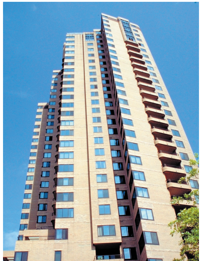
The three-story rowhouses sit comfortably within a neighborhood of high-rise condominiums and commercial office and retail activity.