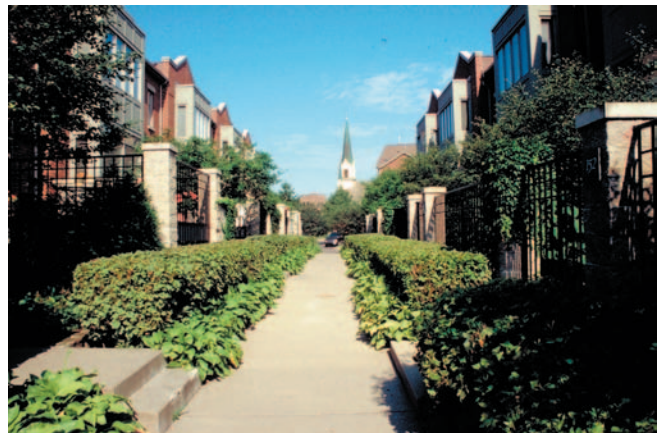
The rowhouses have three different street relationships. Some units closely front the street; other units are set back approximately thirty feet from the street. The units pictured above front a raised pedestrian path. Porches provide private open space and, along with the landscaping, help make this an intimate neighborhood street.