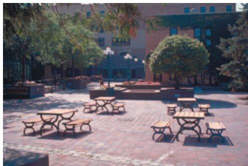
Plazas, landscaping, and fountains throughout the St. Anthony Main and Riverplace commercial area serve as community open spaces for local residents, including the Lourdes Square rowhouses and nearby condominiums.