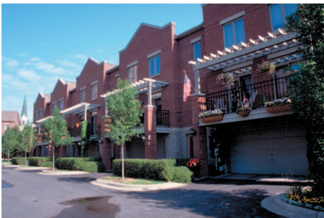
Tuck-under garages at the rear of the rowhouses provide off-street parking for residents. Shaded decks and landscaping humanize this paved area.