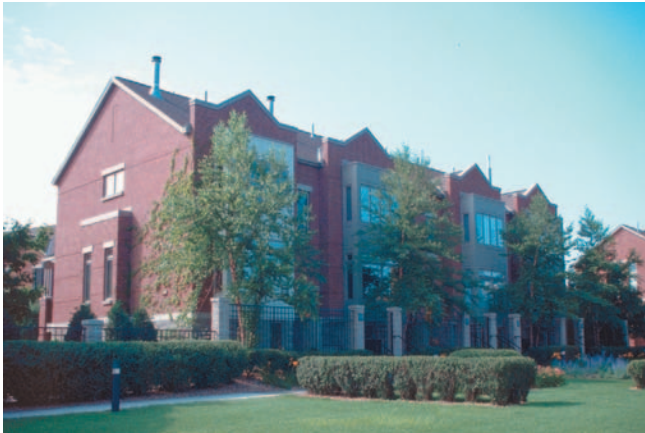
The Lourdes Square rowhouses are located near the St. Anthony Main and Riverplace commercial area, on the west bank of the Mississippi River, across from downtown Minneapolis.