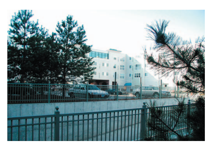
The entry to below-grade parking is in one corner of the central courtyard and partially screened by vegetation.