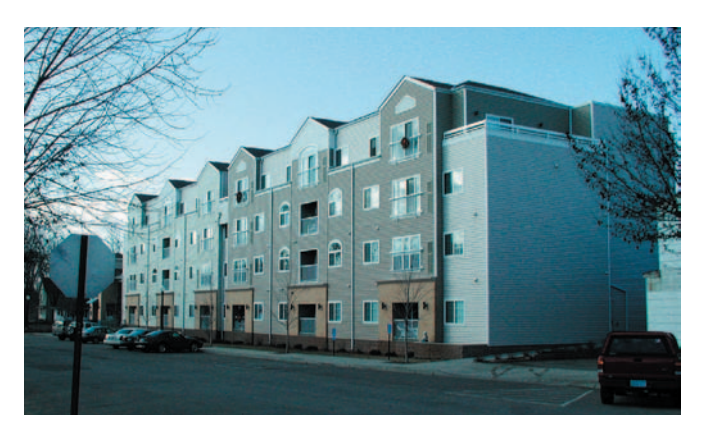
Large building faces are broken down into smaller volumes in several ways: shallow insets, frequent vertical elements, and material and color changes.