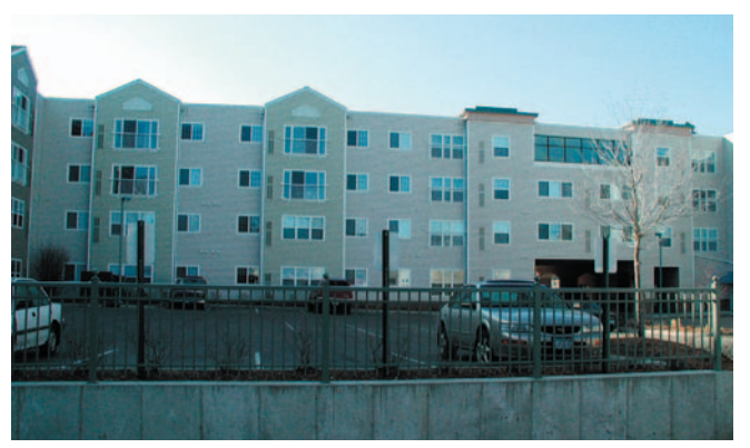
At the center of the block, an open area provides surface parking, some vegetation and an entrance to parking below the building.