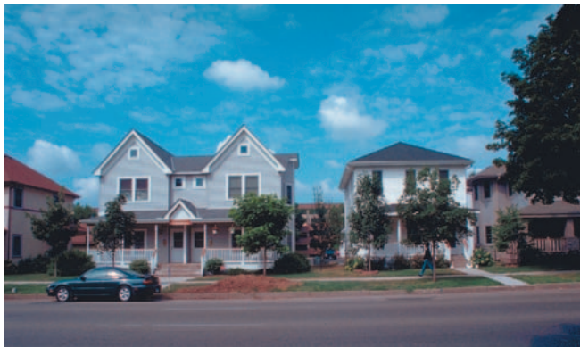
Portland Place includes single-family, detached homes, duplexes, and rowhouses at affordable and market rates, to accommodate a diverse population of residents.