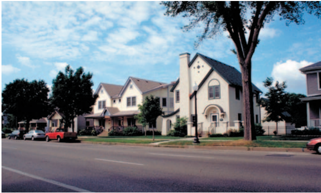
Local nonprofit developer, Project for Pride in Living , built Portland Place on a site that was cleared of rundown housing in the Phillips neighborhood of Minneapolis