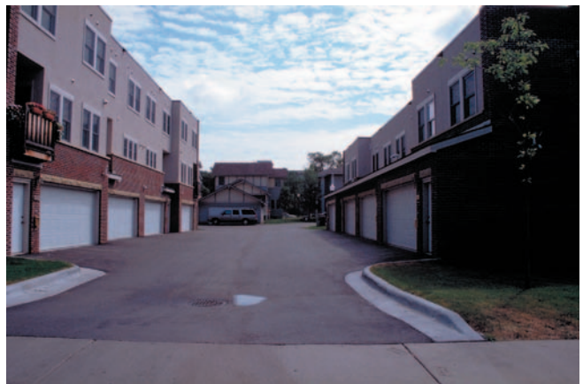
The rowhouses have tuck-under garages at their rear, and the single-family, detached homes and duplexes have rear alley garages, to provide residents with off-street parking.