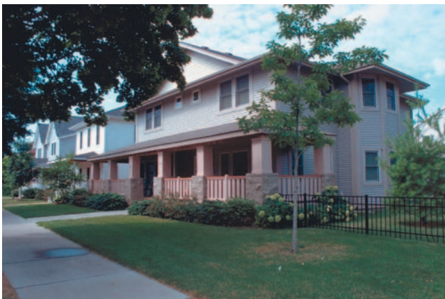
The houses have traditional neighborhood amenities such as front porches and sidewalks.