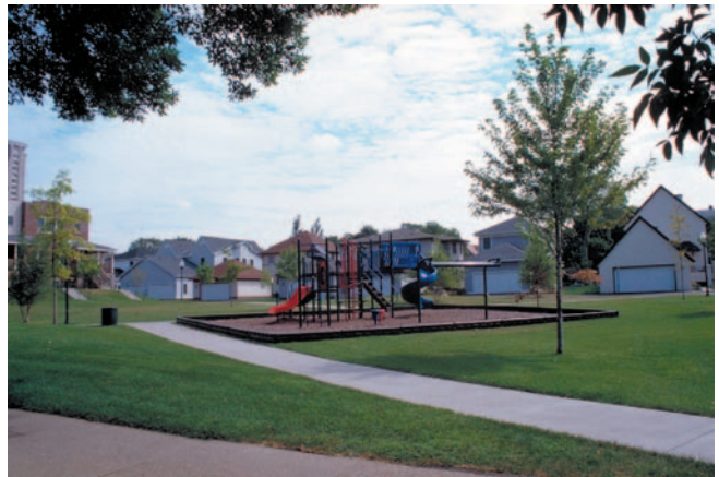
The houses are organized in a U-shape on the site, surrounding a community park and playground.