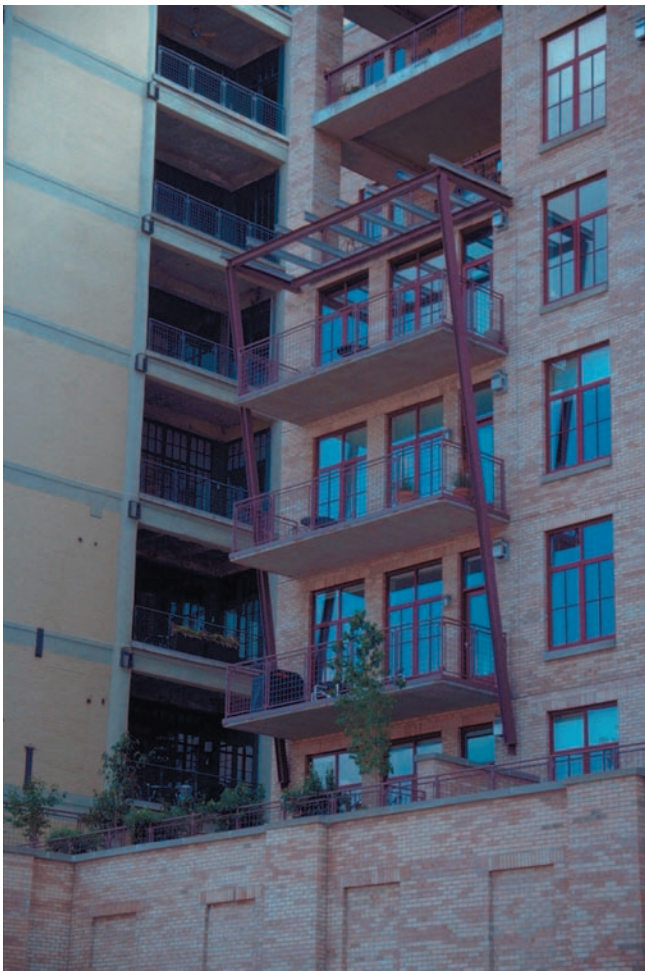
The design of these buildings reinforces the industrial aesthetic and history of the Mill District.