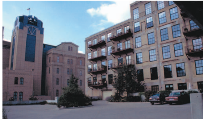
Underground parking garages accommodate most resident parking. Guest parking is available in a few small surface parking lots, and along surrounding streets.