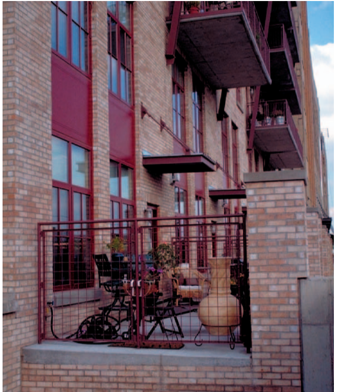
These lofts, which have dramatic views of the Mississippi River, have no affordable housing units. Nevertheless, they, serve to demonstrate the potential of mid-rise apartments, built with common, industrial materials.