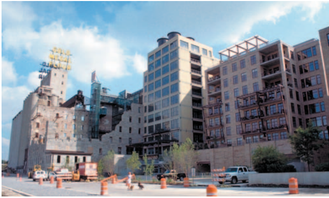
The Northstar Blankets Lofts, the Washburn Lofts, the Stone Arch Lofts, the Humboldt Lofts, and the new Mill City Museum comprise this block of renovated mill buildings along the east bank of the Mississippi River. These buildings vary in height from six to ten stories.