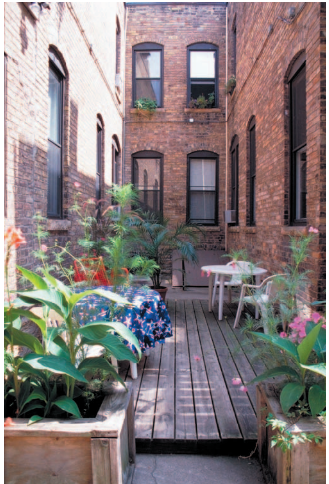
Narrow light wells at the rear of the rowhouses also serve as small, shared patios.