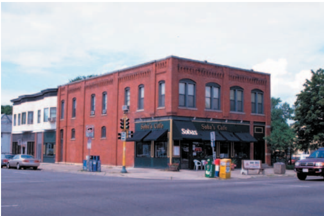
The neighborhood includes numerous commercial activities and mixed-use buildings.