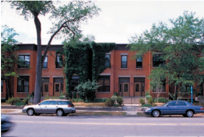
This block illustrates one of only a few examples of stacked rowhouses in the Twin Cities. Although this two-story building has the appearance of a structure of side-attached rowhouses, with individual entrances, it actually houses apartments, or “flats.”