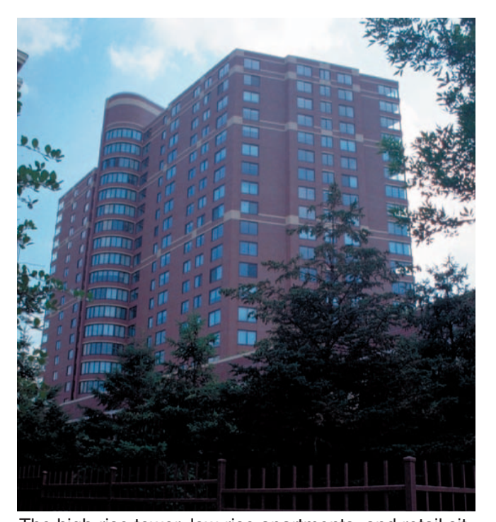
The high-rise tower, low-rise apartments, and retail sit comfortably alongside one another on a landscaped, high-density urban site.