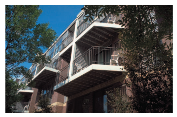
Decks provide residents with private open space within this high-density urban neighborhood.