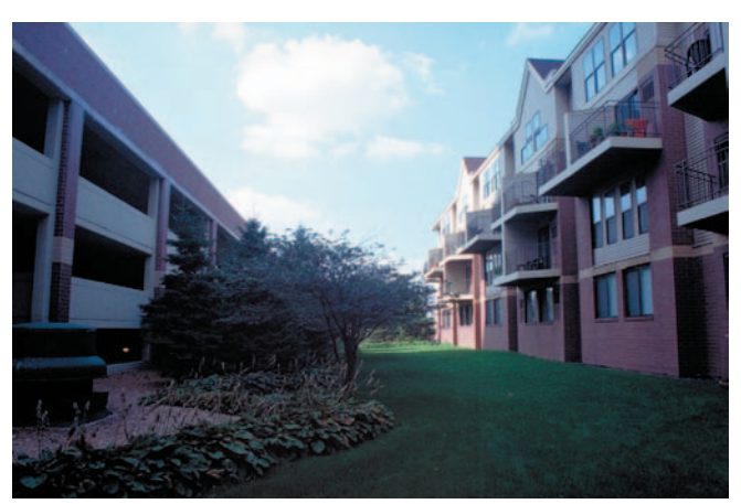
Off-street parking is accommodated in both aboveground structures and below-ground garages. The above-ground parking structures are well-landscaped to mitigate their aesthetic impact.