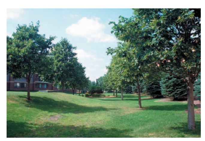
The buildings of Laurel Village provide an urban face to the city, closely fronting sidewalks and streets. The interior of the site is landscaped with a green lawn that provides residents with a communal, parklike recreational space.