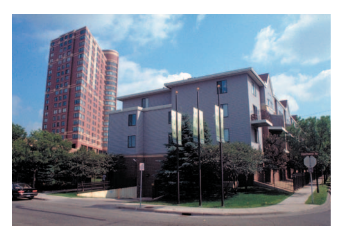
Laurel Village is a mixed-use residential and commercial development in downtown Minneapolis. It combines low- and high-rise apartments with ground-floor retail.