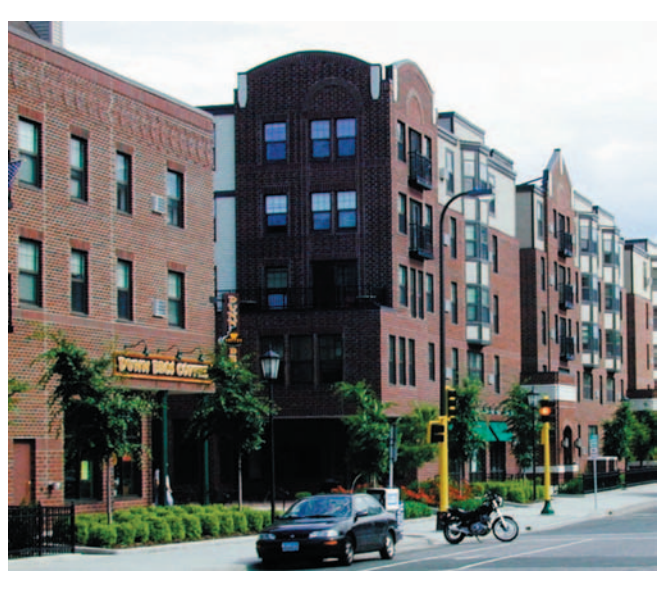
The mix of apartments and retail in East Village creates a strong, lively street edge that has revitalized its Elliot park neighborhood.