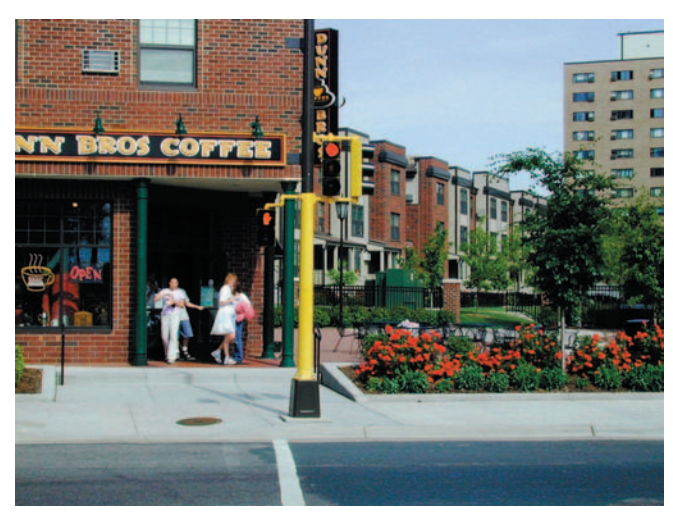
East Village is a mixed-use development that provides a variety of housing choices for a variety of income levels in a compact, urban neighborhood on the edge of downtown.